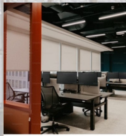
Age-Care Regional office fitout