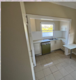
Joinery, and unit upgrades